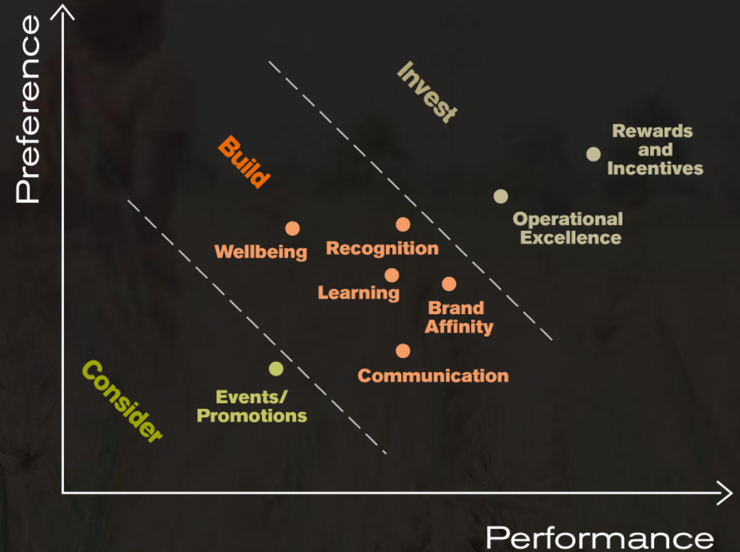
The IBC [Invest, Build, and Consider] Engagement Framework

Consider 'drivers' are not so important for brands to focus on for influencing preference and performance as they have limited or marginal impact the overall brand-channel partner relationship. However, consider 'drivers' can quickly move into build phase, that's why we recommend watching them carefully.